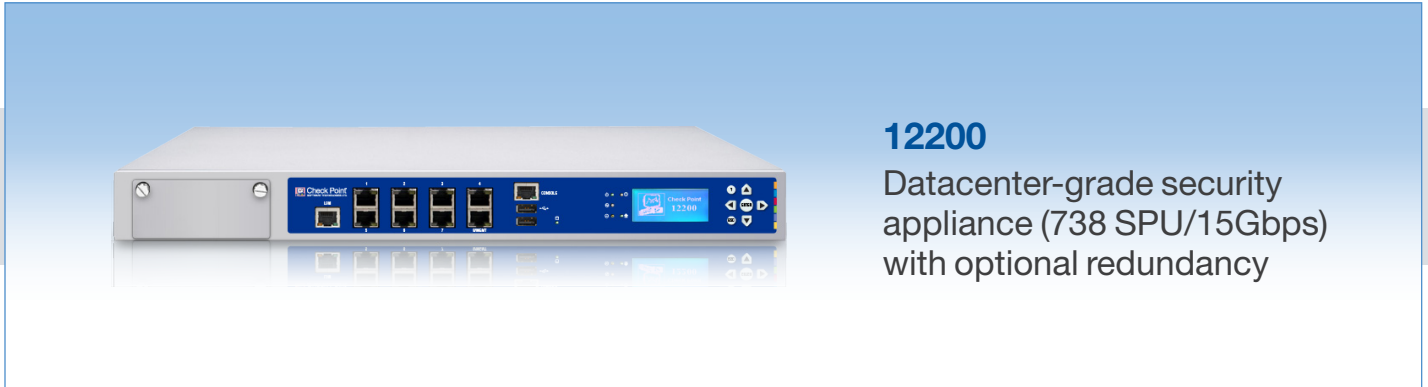
12200 Datacenter-grade security appliance (738 SPU/15Gbps) with optional redundancy