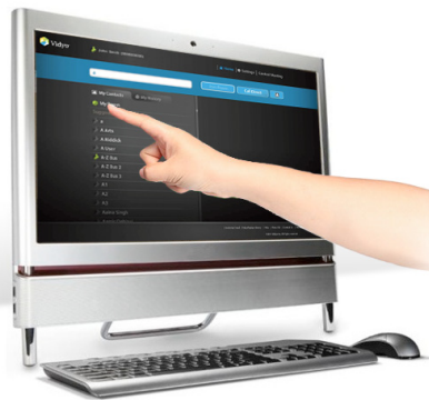
One-click or one-touch to attend a meeting, activate a speed dial, or invite unregistered guests to participate.

VidyoPortal and VidyoRouter software applications run on general-purpose compute platforms, and provide a range of enterprise-class video conferencing capabilities.